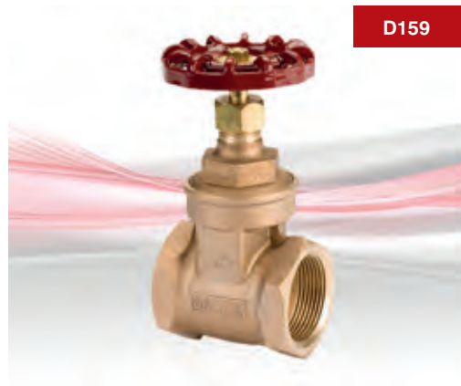
Please note: the photograph & dimensional drawing denotes sizes 1/2" - 2" only.