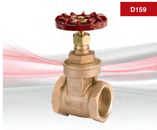
Please note: the photograph & dimensional drawing denotes sizes 1/2" - 2" only.